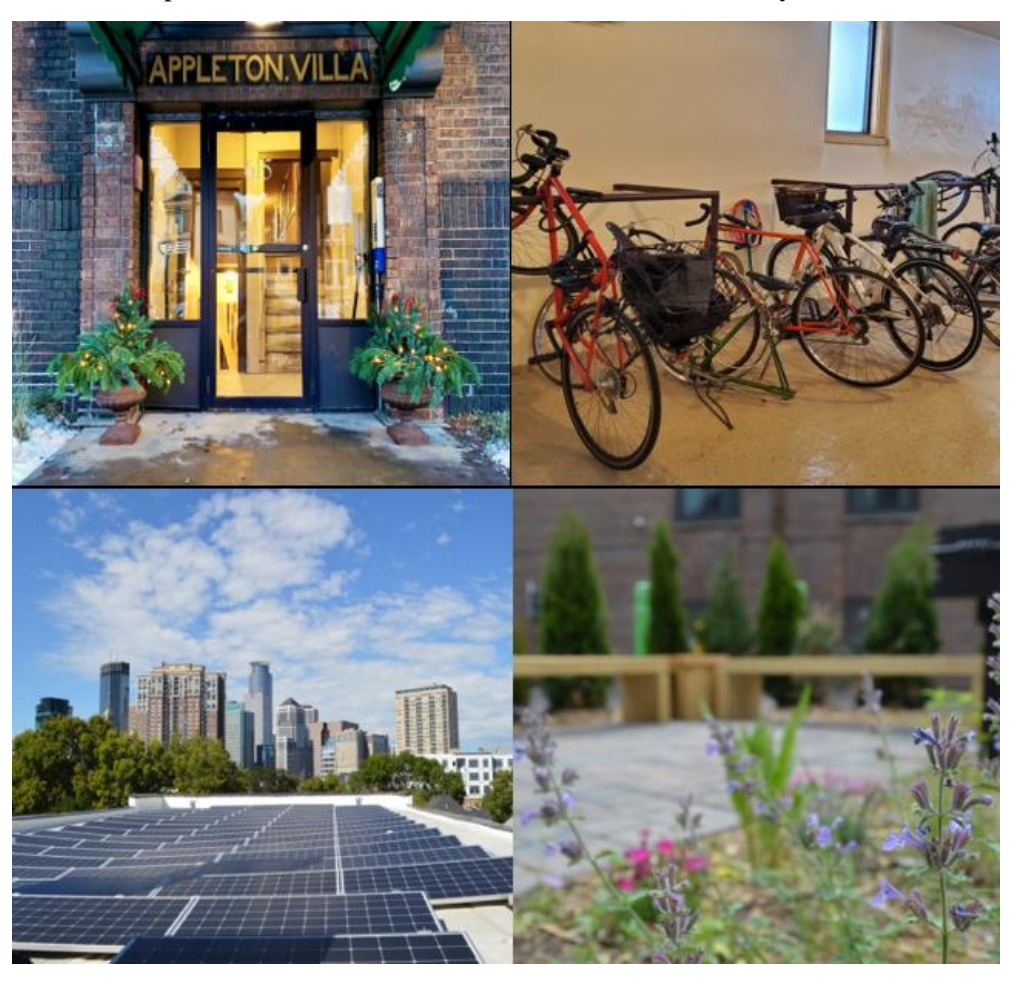
Presented by MRES in collaboration with Green Rock Apartments February 2023

Guide to reducing the carbon footprint of older multifamily housing buildings that is both profitable and satisfies the desires and trends of today's rental market.